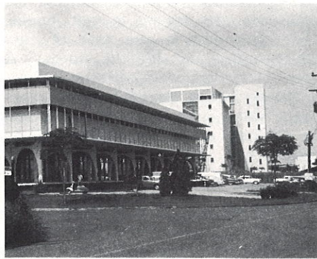
Radio Church of God Offices occupy the corner of the CCC Building